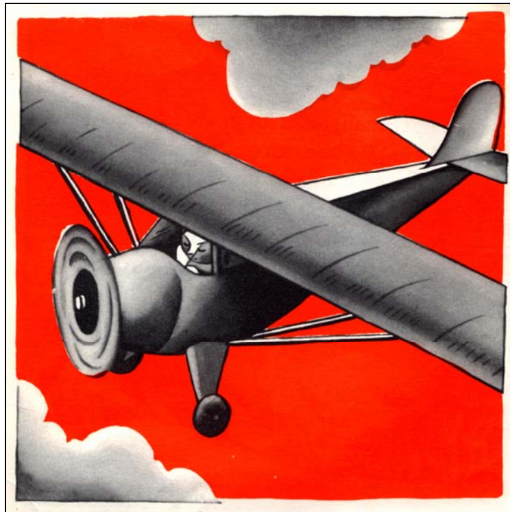
'The Little Aeroplane' by 'Lois Lenski'

My favourite book as a child had been Pilot Small and here I was as my childhood hero. The feelings one experiences in an open plane are so entirely different to those felt in an enclosed one that they cannot be compared. To begin with the land below was mainly neat little squares of banana plantations, but soon their order gave way to mountain ranges and miles of forest. We were flying no more than 1,000 feet above the terrain, so I could see everything as clear as day.