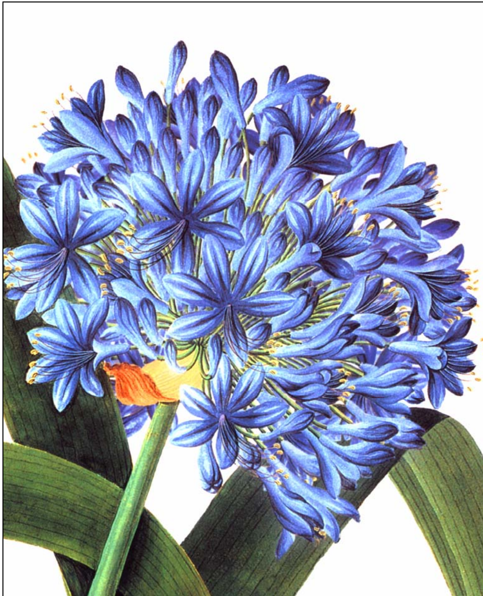
Agapanthus in Madeira

When I was holidaying in Madeira, aged 15, the agapanthus , growing wild along the roadsides in the mountains, stunned me with their beauty. The blue petals and the waxy green leaves made a lasting impression on my mind.