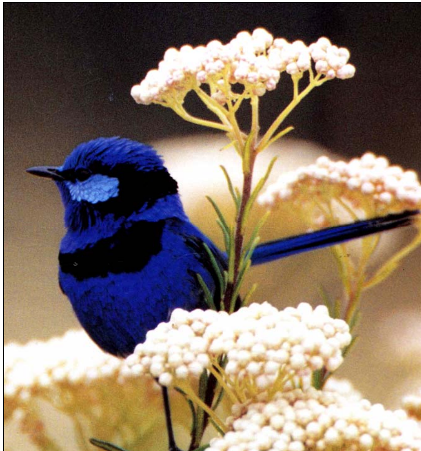
Australian Blue Wren

Margie's wedding dowry included her knowledge of birds, as she knows so many of them by name and recognises their calls. Until our marriage I was unaware of the different bird songs. Australian bird plumage is often dazzling. Blues, reds, greens, whites and yellows. The blue wren has a plumage that is beyond compare, almost unbelievable in intensity.