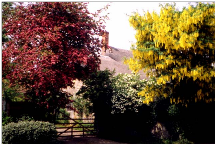
May, Snowball and Laburnum flowering at our front gate

Beside the oak is a stream called the Cam that runs to Queen Camel, a village once owned by Henry VIII's mother, and where he banished Queen Catherine for a time. The ford at Queen Camel is guarded by the Bronze-Age fort of Camelot . This fort was first occupied 5,000 years ago and remained so until medieval times. From the fort you can see the Isle of Avalon, home of Glastonbury Abbey, where a thorn tree growing from Joseph of Arimathea's staff, flowers on Christmas Day! King Arthur was supposedly buried in the Abbey, but wasn't allowed to rest in peace , as he was dug up by Henry II in 1189, moved in 1278 by Edward I, and in 1539 Henry VIII scattered his bones!