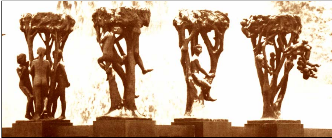
'Children in the Trees', by Gustav Vigeland