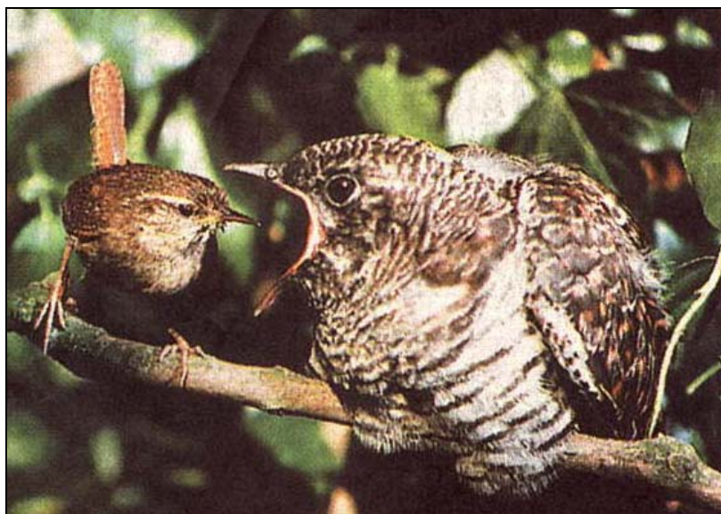
Cuckoo being fed by its surrogate mother Wren

Our garden walls are home to several families of tits and wrens who hop about like tiny mice. Why aren't blue tits called yellow tits ? Wrens weigh less than a champagne cork and yet, as this photograph shows, they are able to feed a baby cuckoo , something that leads me back to the staggering mysteries that make up the life that surrounds us. We often hear cuckoos in the spring when out walking and for me they represent one of the great wonders of Nature.