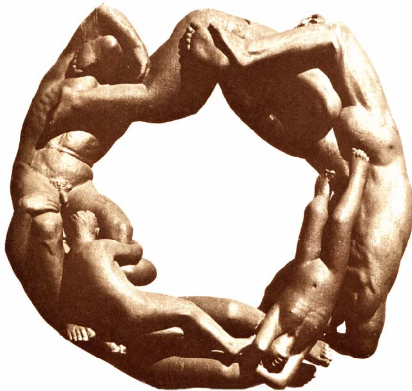
'Wheel of Life', by Gustav Vigeland

CLICK HERE to see other Vigeland photographs