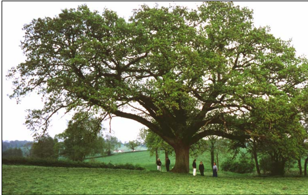
The 300-year-old oak near Agecroft

They stand under the tree in awe, looking up in wonderment. I read somewhere that Bismarck suffered from backache and to relieve the pain he would press his spine against the trunk of an ancient oak. If you do this to our oak it really does feel as though the tree's energy flows into your spine!