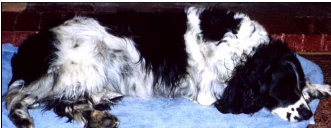
Holly's favourite position

Would we ever own another Springer Spaniel? Well, she is very strong-willed and when she can catch them, eats baby rabbits! If the fire isn't lit she retires into her cave under an armchair and growls if disturbed. She is getting fat, which is my fault because I feed her titbits when we are having our meals. The kennel owner took one look at her the other day and announced she was a 'tad portly'. However, she has one of the most endearing personalities that we have ever come across and often makes us burst out laughing. The grandchildren love her and we wouldn't part with her for all the tea in China.