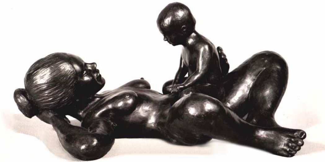
Mother and Child