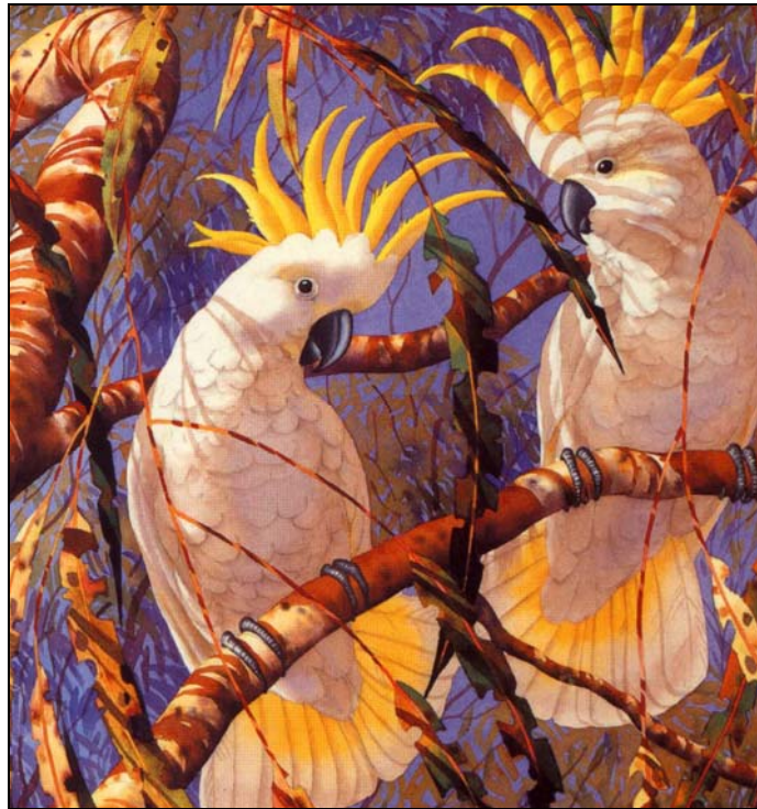
Sulphur Crested Cockatoos

Parrots and rosellas , although extremely raucous, are an explosion of colour and the sulphur crested cockatoos are simply stunning.