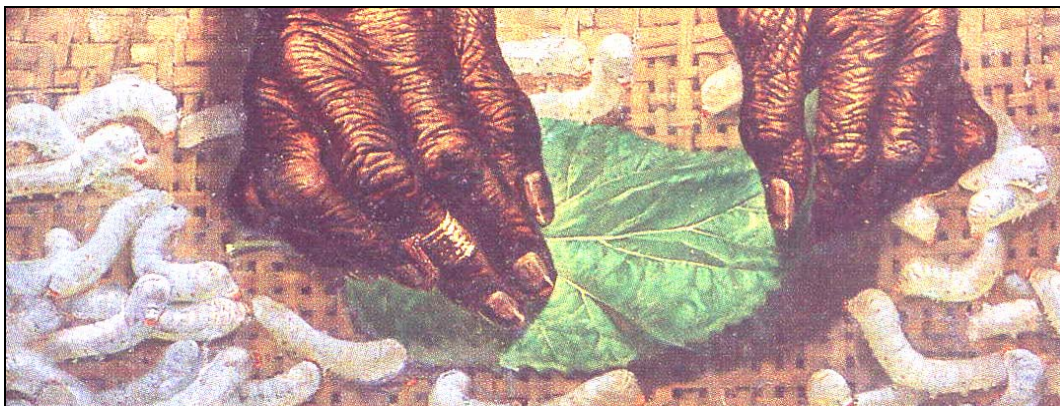
'Silkworms', detail from Robert A. Hefner III's Chinese collection

After 28 days it ejects a single thread to anchor itself down and, tossing its head in a figure-of-eight motion, wraps itself in a liquid thread that flows out at a rate of 12 inches a minute! The thread hardens on contact with air to become the cocoon from which the moth emerges 14 days later, mates and dies three or four days later after laying her eggs. Nature doesn't take holidays!