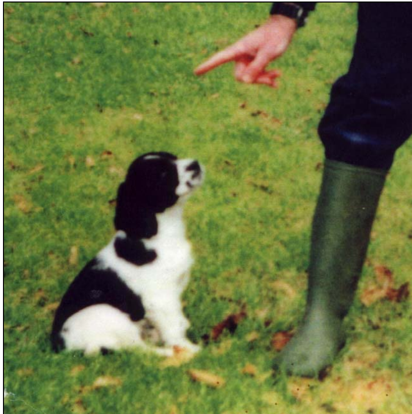
Holly of Holcombe

they sometimes have a chocolate biscuit in their hand. She decided that she was human about two years ago and demanded to sleep at the foot of my bed!