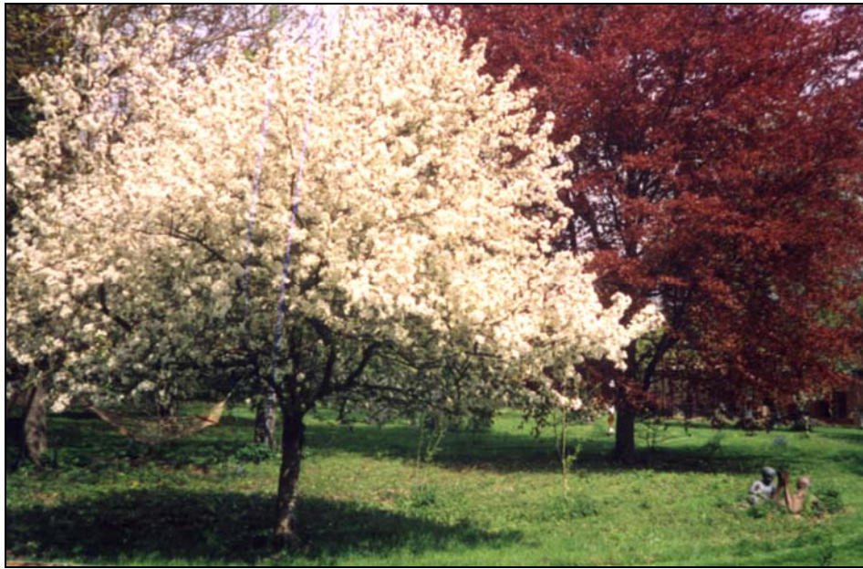
Crab apple and Copper beech in the garden

The trees we have planted in our old orchard have become a wood. The crab-apple and the copper beech add colour to the greens of oak and chestnut while the balsam poplars fill the evening air with intoxicating scent.