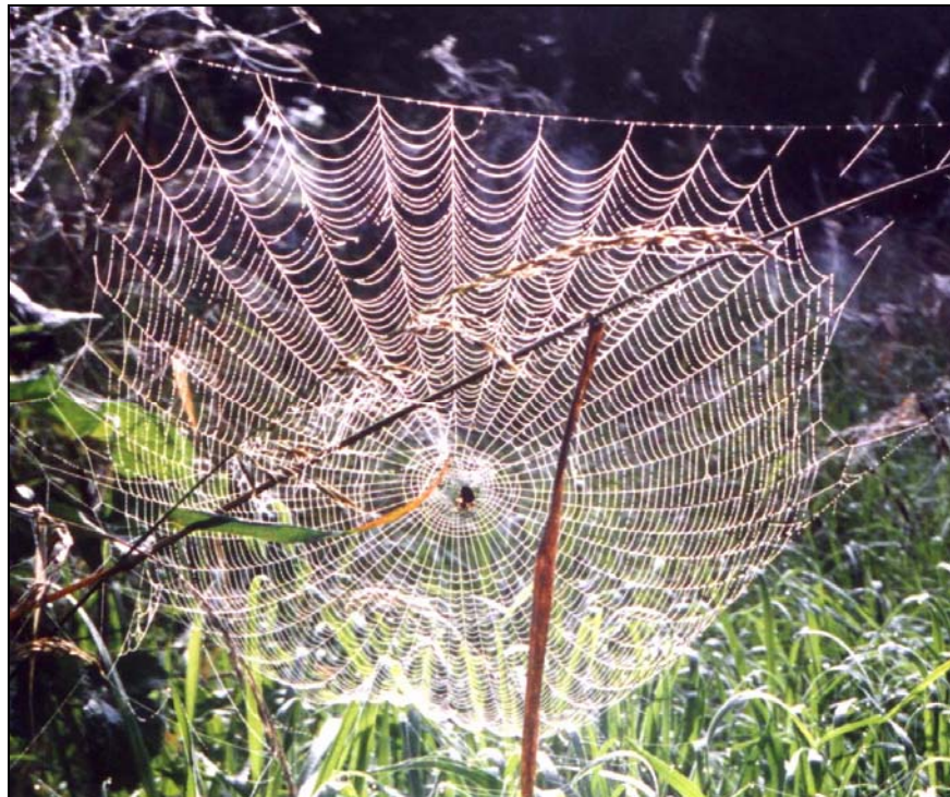
On frosty mornings the spiders decorate the orchard

We can see King Arthur's Camelot from the end of the orchard. Our village must have existed for thousands of years as it is built a few hundred yards south of the Hard Way , a road that runs from London to Devon and predates the Roman settlement of Britain in AD 40.